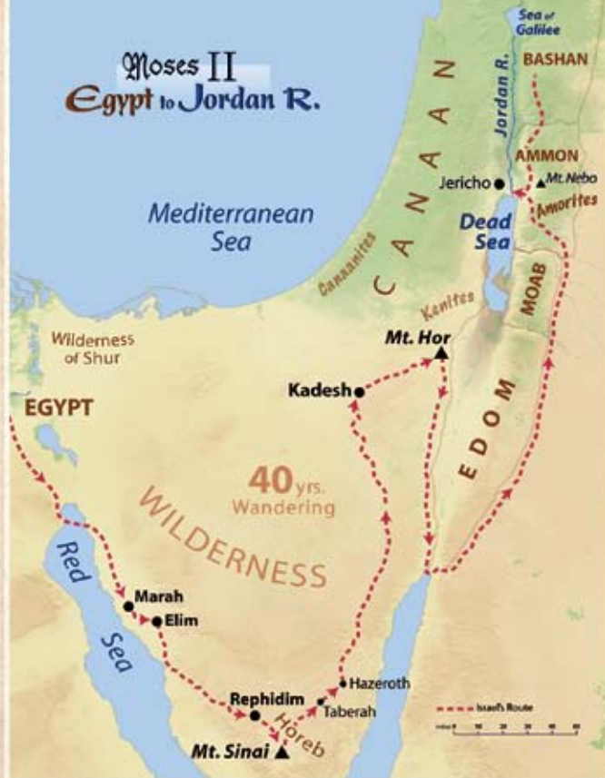
Israel’s journey from Egypt to Jordan River.