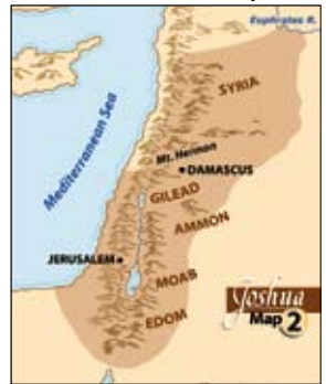
Visual Map 2

But Israel never claimed all the land to the Euphrates river. In King Solomon’s reign, his kingdom reached close to that area, but after his death, Israel lost that.